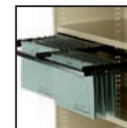
Roll-Out Suspension Frame