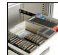
Roll-Out Media Drawer