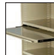
Roll-Out Reference Shelf