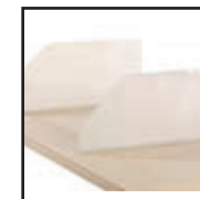
Shelf Divider Polycarbonate