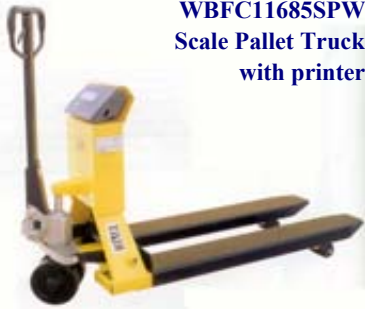
WBFC11685SPW Scale Pallet Truck with printer