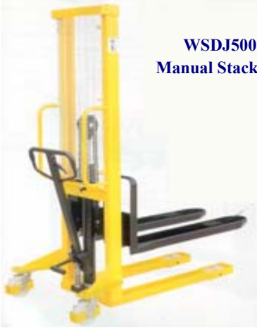
WSDJ50016 Manual Stacker