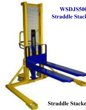
WSDJS50016 Straddle Stacker