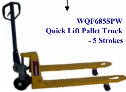
WQF685SPW Quick Lift Pallet Truck - 5 Strokes