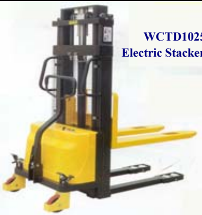
WCTD1025 Electric Stacker