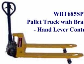
WBT685SPW Pallet Truck with Brake - Hand Lever Control