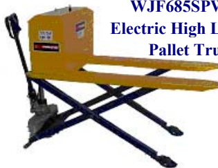
WJF685SPWE Electric High Lift Pallet Truck

• Steering wheel 180mmØ urethane • Load wheel 74mmØ • 2 lateral stabilisers fitted for extra stability