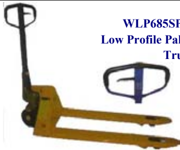
WLP685SPW Low Profile Pallet Truck

• Steering wheel 180mm Ø urethane • Automatic tare function • Handle with rubber comfort grip