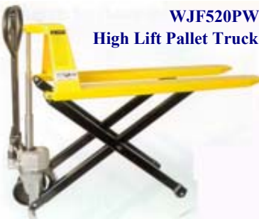
WJF520PW High Lift Pallet Truck