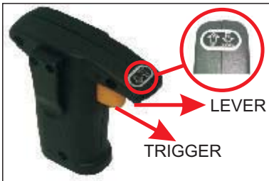
Electric remote control With Variable Speed control.