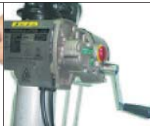
Manually Manual control available in case of power failure.