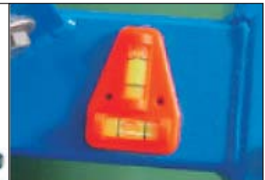
Level Equipped to ensure the proper set up.