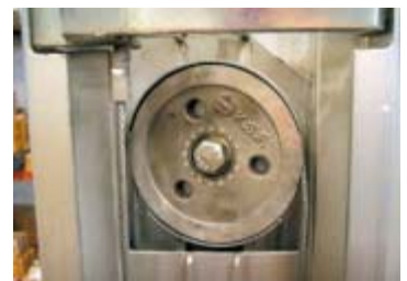
Steel pulleys with upper ring