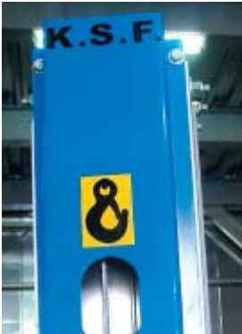
Cable under steel crankbase and crane lifting point for safe transportation.