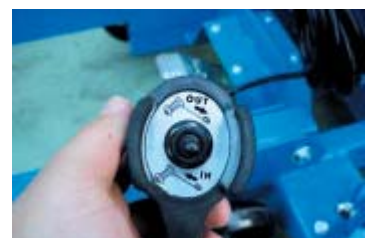
Cable remote control with 5 m cable