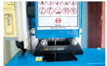
Roller fairlead for the steel cable