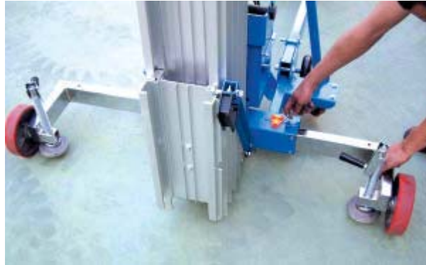
Variable wheelbase chassis with 2 lifting screw and spirit level for usage on a sloping surface.