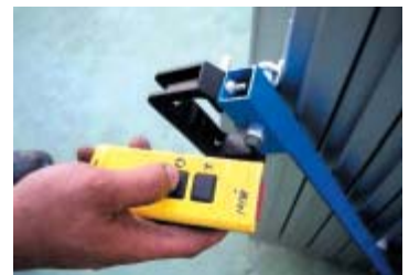
Radio remote control with emergency stop