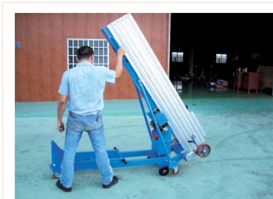
Easy tip of the mast for easy Horizontal or vertical transport.