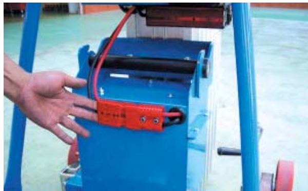
Removable battery protected in a steel housing with quick connector.