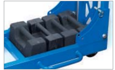
Counter weight 4 x 22.5 kg