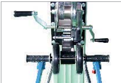
Manual or Electric Operation